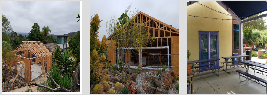
Samuel M. Ciccati Water Education Center

Project 4: Ms Smarty-Plants Grows Water-Wise Communities, sponsored by Water Conservation Garden