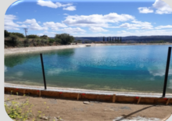
Rancho Estates Mutual Water Company Systems Upgrades