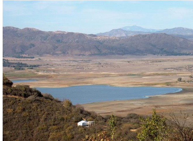
Lake Henshaw from Mesa Grande Road

A 200 square-mile watershed, mostly undeveloped and shared by Santa Ysabel and Los Coyotes Reservations and VID, provides runoff to Lake Henshaw. Natural runoff from this watershed along with groundwater pumped from the Warner Basin, a 37 square-mile basin to the east of Lake Henshaw, is stored in Lake Henshaw. Henshaw water is delivered to VID, the City of Escondido and the Rincon Band of Indians.