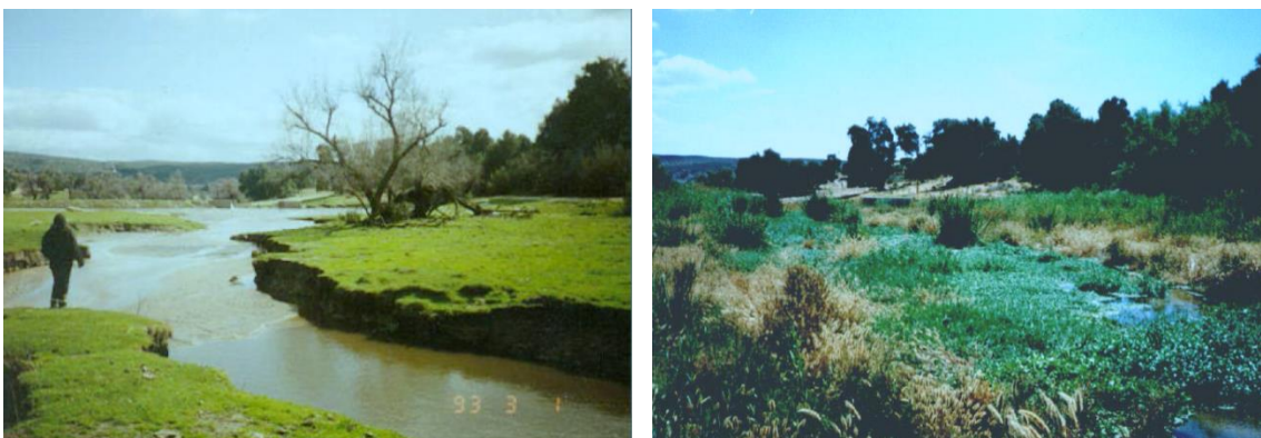
River landscape before and after rock drop structure installation at Campo Reservation.

One particularly important TEK water management technique used on Tribal lands and conservancy efforts is irrigation, by supplying select land areas with water through means of diversion and artificial channels (Anderson and Nabhan 1991). Rock drops and gabions are two types of water management tools used to manipulate the movement of water to increase its potential positive benefits in an area. When a stream or river runs too fast, the surrounding banks tend to erode, habitat potential is lost, and groundwater recharge is limited. In order to stabilize stream flow, enhance groundwater recharge, and create riparian habitats, rock drops are used (Connolly 2013). Similar to a dam, but much less invasive, rock drops are created by the dry (non-cemented) layering of large boulders perpendicular to the natural water flow. This causes the flow to slow and water to saturate the ground more deeply and with more breadth, recharging the water table and stabilizing the stream. The following images, presented by Michael Connolly of the Campo Kumeyaay Nation at the 2013 Tribal Water Summit, illustrate the substantial effect rock drop structures have on an environment.